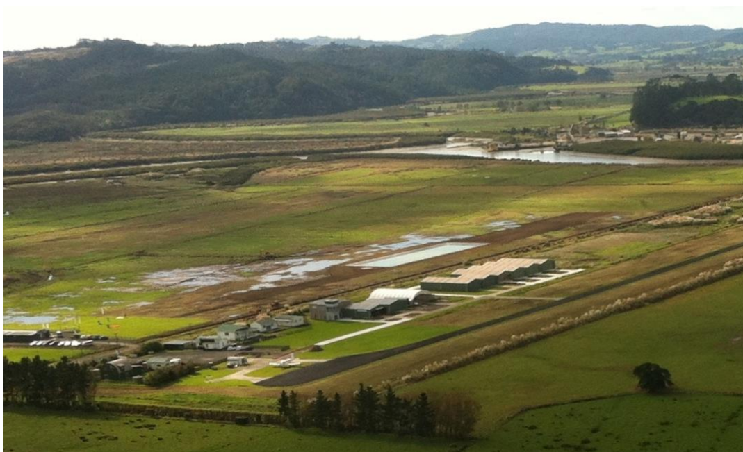
West Auckland Airport Parakai

Aimm has contacts with Flying Schools (and those wanting to start one) and have been able to assist small airports in obtaining a very valuable addition to their town.